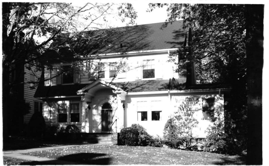
Board of Realtors of the Oranges and Maplewood