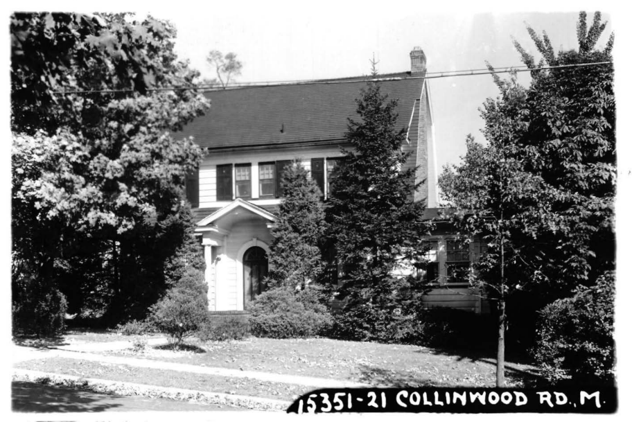
Roard of Realtors of the Oranges and Manlewood.